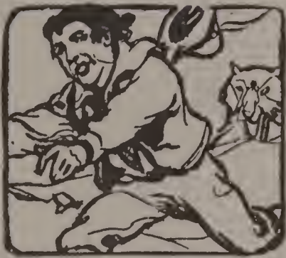
He Dropped His Bag of Food and Fled.

“IT was very wild and lonely in the dark woods where Johnnie Wolf and his family lived. But he was a home body and liked to be alone with his family. The people in the nearest village had heard that a family of wolves lived in the forest, so do you blame them for not going there?” said daddy.